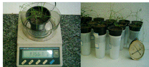
Fig. 1 A view of the site of experiment of the study.

thoroughly wilted. The conditions have been adjusted in such a way to allow plants to receive direct sunlight and not to be affected by natural rainfall. All measurements were made at 2 PM, when the maximum transpiration rate was expected (Kirnak et al. , 2001). The amounts of daily evapotranspiration of aforesaid species as well as evaporation from bare soil surfaces were measured using gravimetric method. This method has been noted as the simplest and the most applicable technique through determining the weigh lost during a day (Kirnak et al. , 2001) with the help of scale having 0.0001gr accuracy. A view of the site of experiment is shown in Fig. 1.