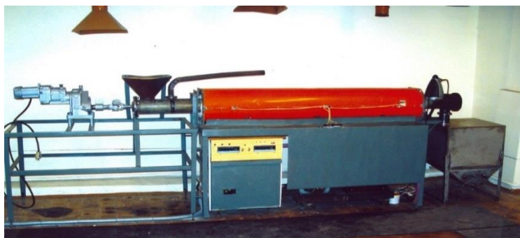
Fig. 1. Carbonization installation diagram.

The operating principle of an atomic absorption spectrometer is based on measuring the absorption value of a beam of light passing through the atomic vapor of the sample under study. An atomizer is used to convert the test substance into atomic vapor. Various narrowband light sources are used as a light source.