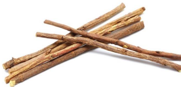
Fig. 1. Licorice plant with scientific name Glycyrrhiza glabra L.

structure that exhibits a strong anticancer effect. Glycyrrhizin, glycyrrhizinic acid, isolicyritin and glycyrrhizic acid are other main chemicals of this plant with anti-atherogenic, anti-cancer, anti-diabetic, antimicrobial, anti-spasm, anti-inflammatory and anti-asthma properties (Dang et al. 2024). Licorice has also been proven to help relief fatigue and weakness. In addition, it acts as an anti-inflammatory, reduces allergic responses and prevents liver damage. According to the World Health Organization (WHO), licorice is used as a soothing agent for sore throats and an expectorant for bronchial disorders and coughs (Peng et al. 2015). There have been no reports of potentially toxic compounds from the species studied so far. However, some adverse consequences, such as the use of high doses over a long period, which lead to serious diseases, are known. However, this plant may be used for medicinal purposes in small amounts for serious ailments and there are no known side effects (Dastagir & Rizvi 2016; Dang et al. 2024).