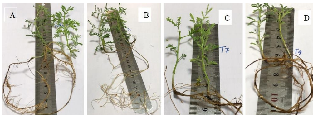
Fig. 4. Growing of Acacia tortilis seedlings after 2 months in T_2 (A), T_4 (B), T_7 (C) and T_9 (D).