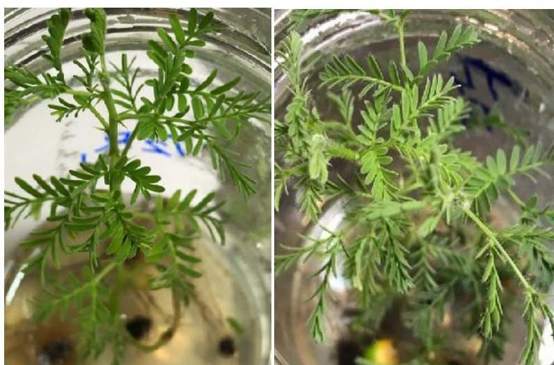
Fig. 3. Seedlings of Acacia tortilis Under in vitro condition in T_2 (A) and T_4 (B).