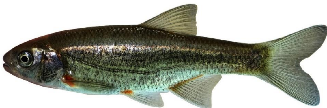
Fig. 1. Alburnoides petrubanarescui , recorded from Nazlu Chay River, Urmia Lake basin, standard length 71 mm.

The A. petrubanarescui population size has not been conducted. Their population is limited and they are caught by chance in Nazlu Chay (Figs. 2 - 3).