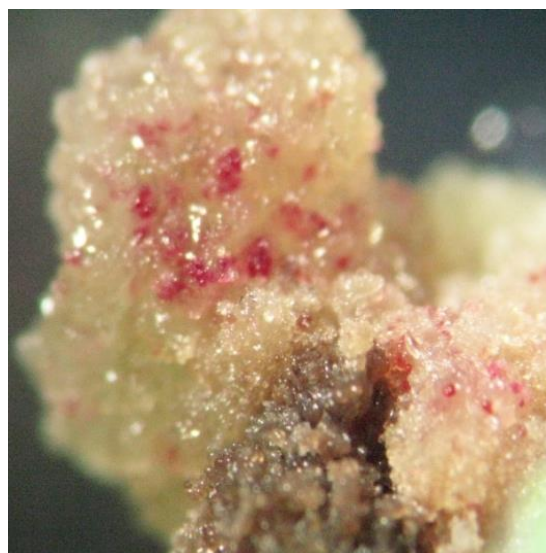
Fig. 2. Callus in the culture of isolated beetroot ovules.