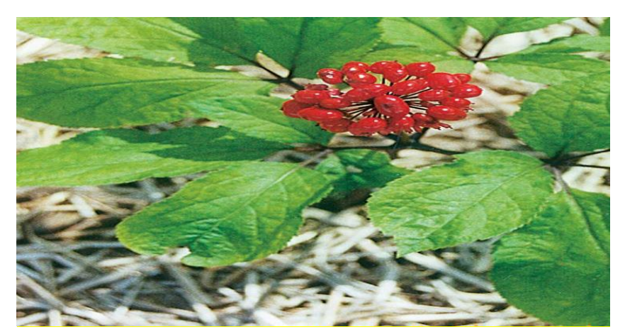
Panax ginseng plant.

P. ginseng contains many active substances. The substances thought to be most important are called ginsenosides or panaxosides. Ginsenosides is the term coined by Asian researchers, and the term panaxosides was chosen by early Russian researchers. P. ginseng is often referred to as a general well-being medication, because it affects many different systems of the body.