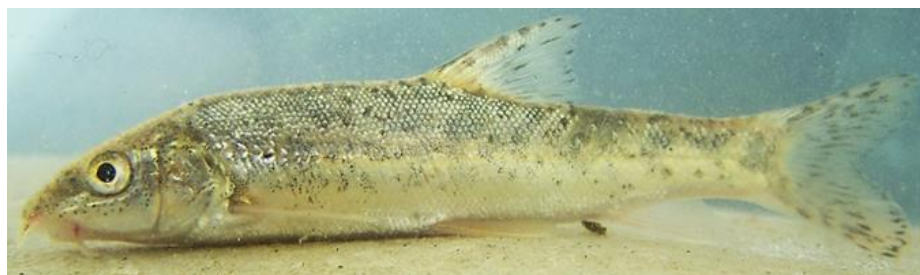
Fig. 1. Barbus cyri caught from Tootkabon River.

Little information is available regarding biology and ecology of B. cyri , particularly its habitat use and habitat suitability indexes are unknown. Therefore, this study was conducted to assess the habitat use and habitat suitability indexes of B. Cyri with respect to habitat availability of this species in Tootkabon River, a branch of the Sefidrud River in the Southern Caspian Sea basin.