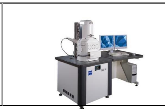
Fig. 2. SEM device

the devices which can detect the elements and compounds present in the sample through a high-precision analysis and defining the proportions of them in one sample (Table 1).