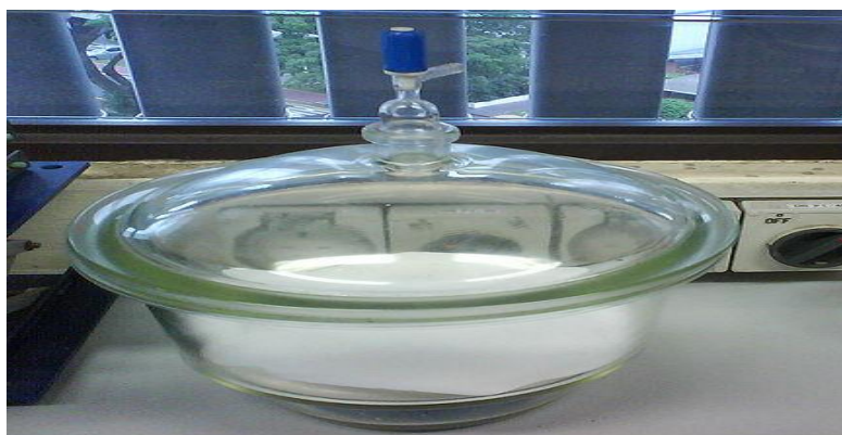
Fig. 3. desiccator device.

Through the above Table, we noticed that the proportions of chemical compounds and elements in one sample are different, as well as their presence in the rest of the samples. Since the proportions of the chemical elements are one part per million, they can be considered negligible. In order to examine the effectiveness of these compounds, which can be effective condensation nuclei, a desiccator device was used. It is a device that removes moisture from the sample or chemical compound using silica gel (Fig. 3).