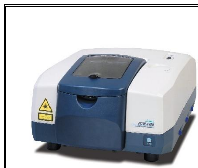
Fig. 1. FT-IR device

In this research, a new technique was used to detect condensation nuclei, which is one of the most important causes of cloud formation, through which the cloud droplet grows. Three types of powders were used: Refrigerated helfa powder, Himalayan salt, generator powder and pollen; and the samples were analyzed by FT-IR and SEM,